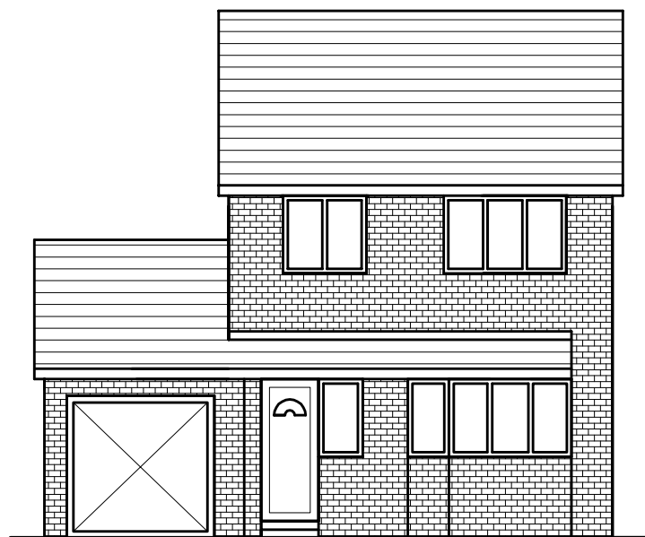
FRONT ELEVATION AS EXISTING (1:100)