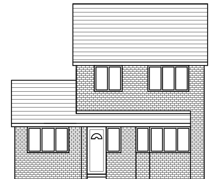
FRONT ELEVATION AS PROPOSED (1:100)