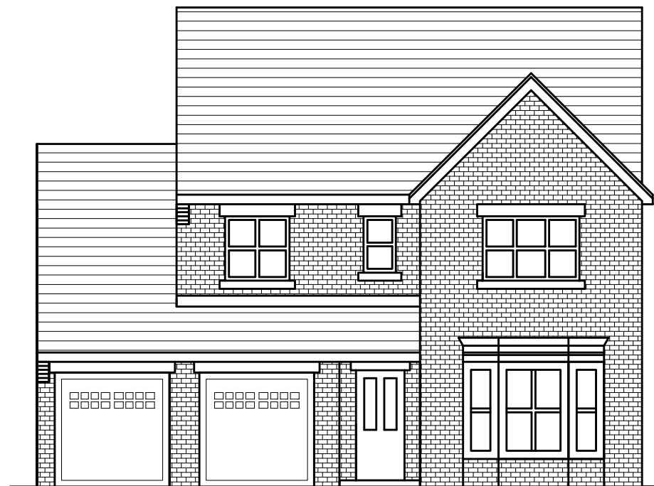
FRONT ELEVATION AS EXISTING (1:100)