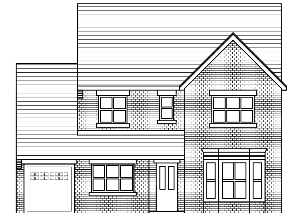
FRONT ELEVATION AS PROPOSED (1:100)